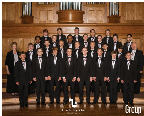
Lincoln Boys Choir